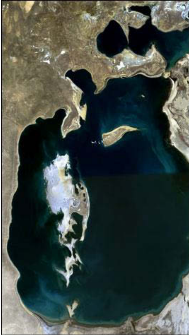
July - September, 1989