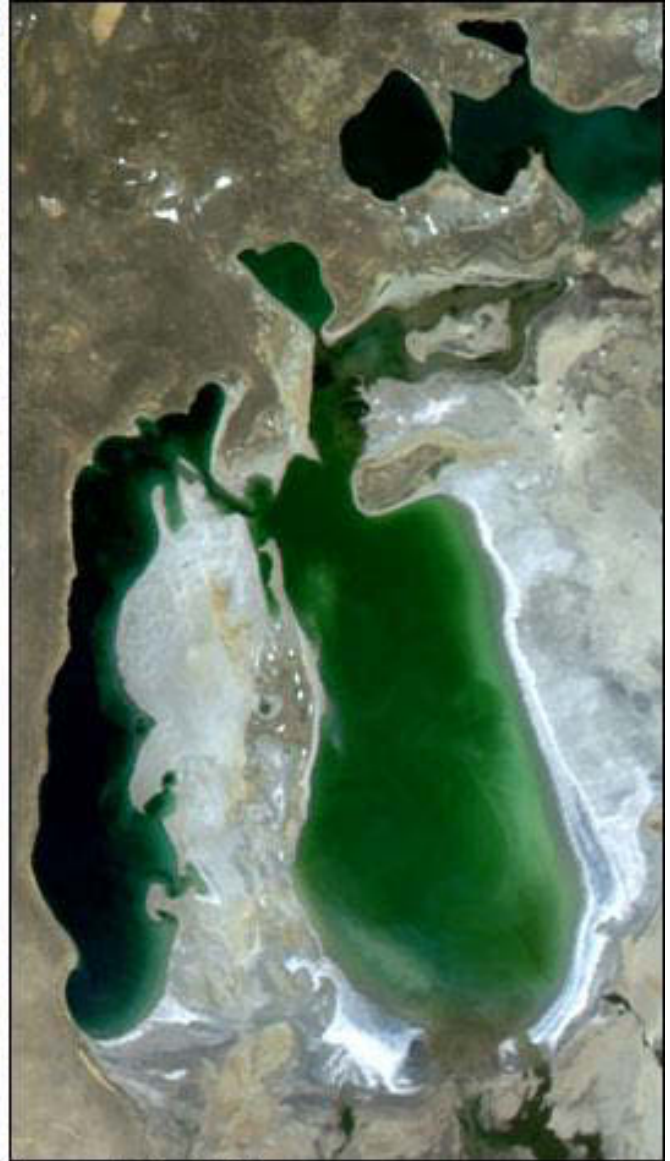
August 12, 2003