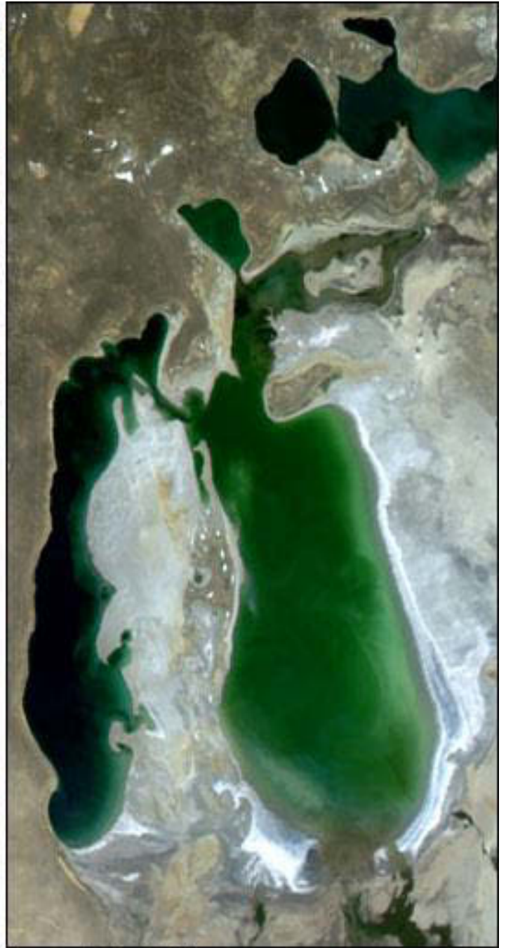
August 12, 2003