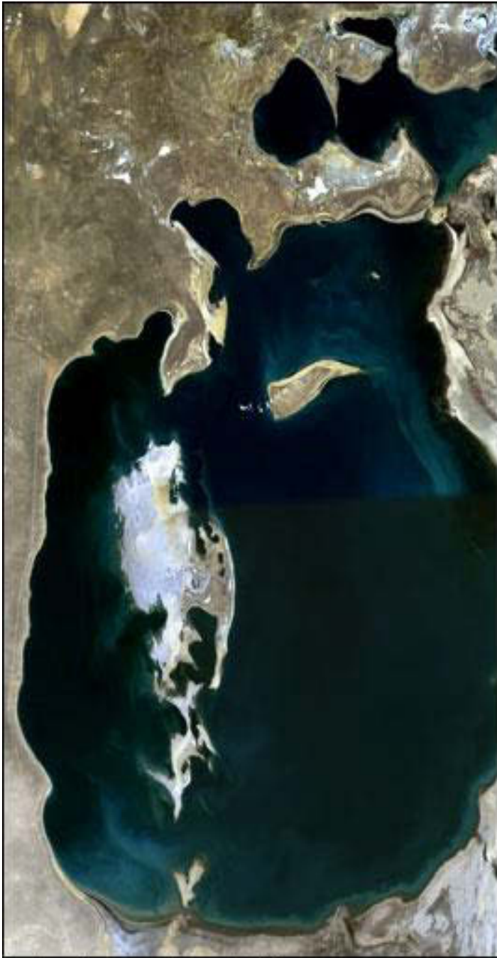
July - September, 1989