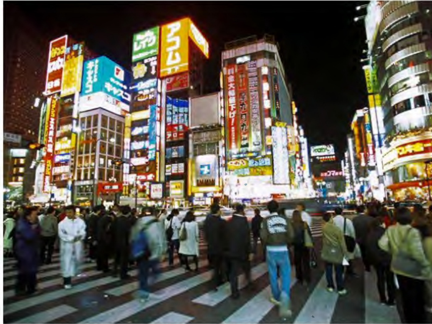
“Tokyo, Japan -- National Geographic’s Ultimate City Guides.” National Geographic . N.p., n.d. Web. 29 July 2014.