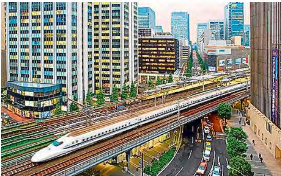
The Telegraph . Telegraph Media Group, n.d. Web. 29 July 2014. < http://www.telegraph.co.uk/travel/destination/japan/115761/36-Hours-In...Tokyo.html >.