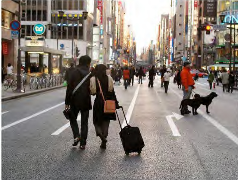
“Tokyo, Japan -- National Geographic's Ultimate City Guides.” National Geographic . N.p., n.d. Web. 29 July 2014.