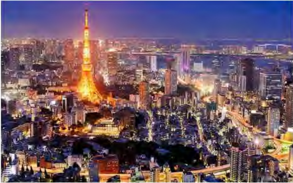
The Telegraph. Telegraph Media Group, n.d. Web. 29 July 2014. < http://www.telegraph.co.uk/travel/destination/japan/115761/36-Hours-In...Tokyo.html >.