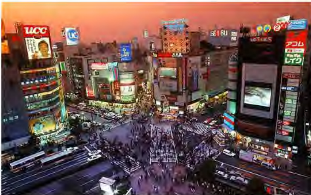
The Telegraph. Telegraph Media Group, n.d. Web. 29 July 2014. < http://www.telegraph.co.uk/travel/destination/japan/115761/36-Hours-In...Tokyo.html >.